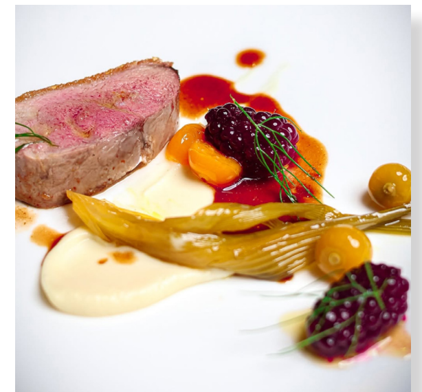
@alexanderprosenickov Dry Aged Duck| Vanilla Parsnip Puree| Fennel Braised in Orange Juice| Huckleberry| Blackberry| Jus made with Blackberry and Juniper