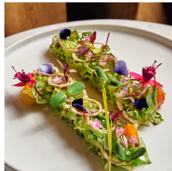
@ baronson1st Sometimes, a dish is so stunning it feels like a work of art—and that's exactly how we feel about our chopped salad. A symphony of colors, textures, and fresh flavors, it's almost *too beautiful to eat*... almost!