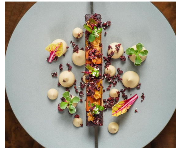
@chefbrandosalo Wood Fired Root Vegetable Skewer smoked celery root tahini, chickpea miso, beetroot- rose dukkah