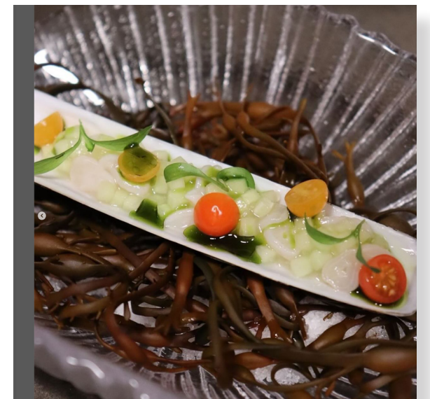
@emmabengtsson.chef Razor clam dressed in a yuzu vinaigrette with cilantro oil served on the side.