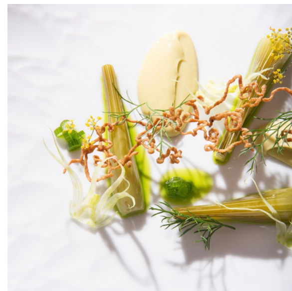
@culinaryvegetableinstitute Fennel composition ( bulb, stem, fronds, blooms, seeds).