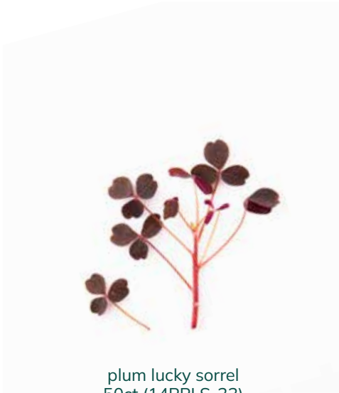
plum lucky sorrel 50ct (14PPLS-33)