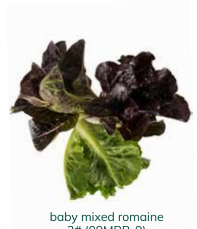
baby mixed romaine 2# (09MBR-9)