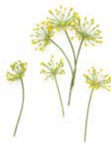
dill blossoms 50ct (05DILLB-33)