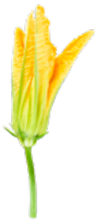
squash blossoms pc (16SB-1)