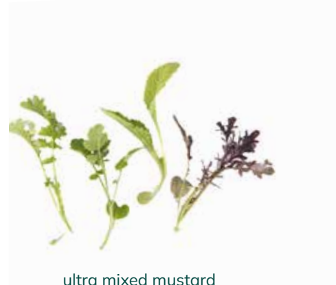
ultra mixed mustard # (09UMM-2)