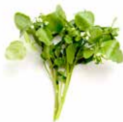
watercress blossoms 50ct (05WB-24)