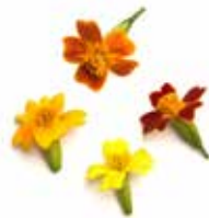
citrus marigold 50ct (05CM-24)