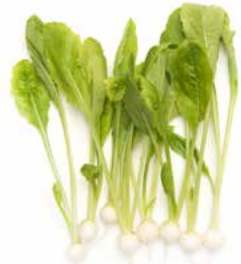
petite white turnip 50ct (01WTP-33)