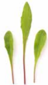
red dandelion (04MRD-33-S)