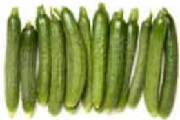
coty cukes 20ct (05DCCU-33)