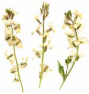
arugula blossoms 50ct (05AB-33)