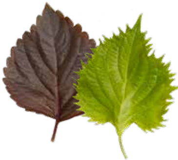
red shiso leaves 50ct (08SHR-33) green shiso leaves 50ct (08SH-33)