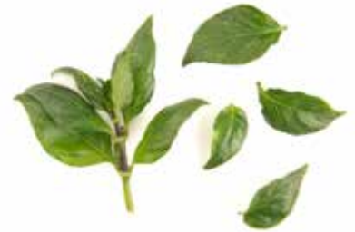
mushroom leaf sprig 25ct (08MRL-33)