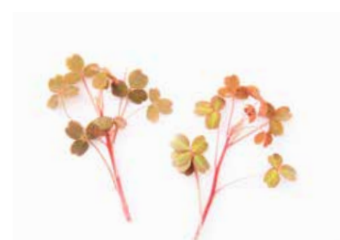
rainbow lucky sorrel 50ct (14PRLS-33)