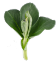
fava bean (04MFB-33-S)