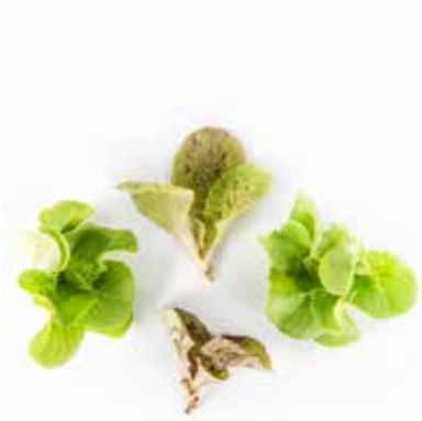
petite mixed lettuce 50ct (09MXP-33)