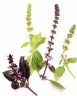
mixed basil bloom 50ct (05MBBL-24)