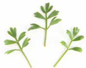
sea samphire 50ct (08SSAM-33)