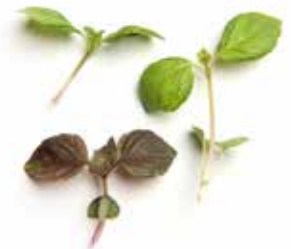
mixed shiso (04MSM-33-L)