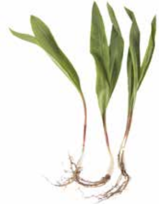
ramps # (01RA-2)