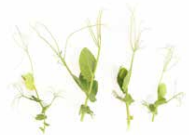
verde pea tendril (04VEPT-33)