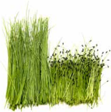
micro chives (04MC-33-E) memo chives (04MCI-33-E)