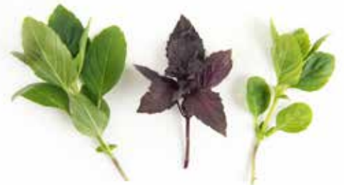
basil sampler (08BS-33)