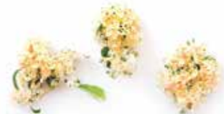
frosted frescura sprig 25ct (05SNCR-33)