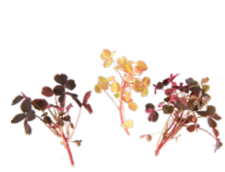
mixed lucky sorrel 50ct (14MXLS-33) mixed lucky sorrel with blooms