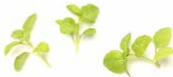
micro pennyroyal mint (14MRP-33-E)