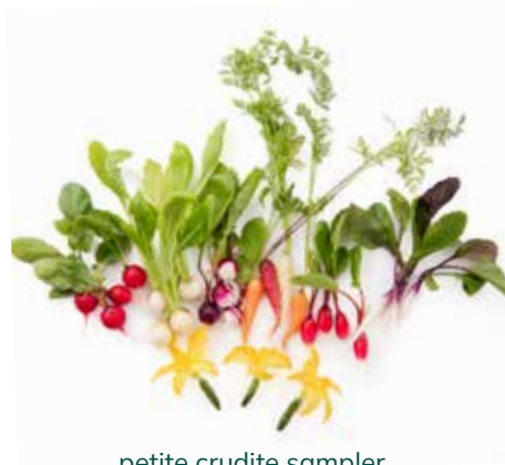
petite crudite sampler 50ct (01PCS-33-L)