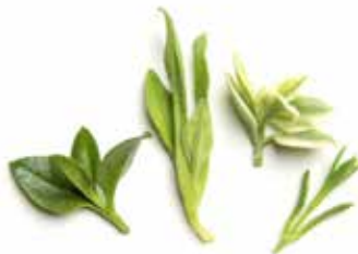
crystal lettuce quartet 50ct (09CLQ-33-S)