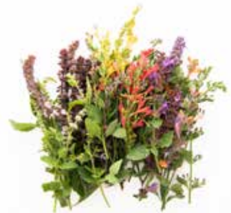
flowering herb sampler (14FHS-33)