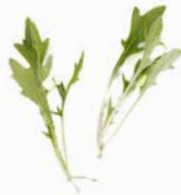
ultra mizuna (09MIZU-33)