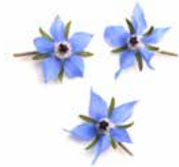
blue borago flower 50ct (05BBOF-24)