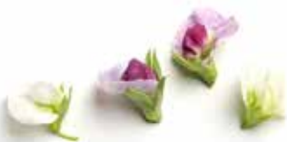
pea blossoms 50ct (05MPBS-33)