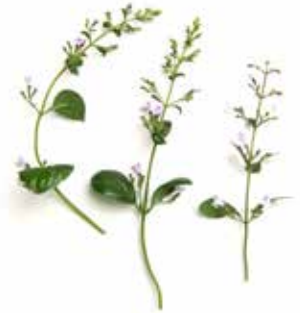
nepitella mint with bloom 50ct (08NEPB-33-S)