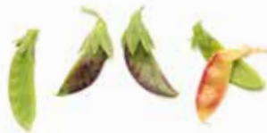
petite snow peas 50ct (20PMP-33)