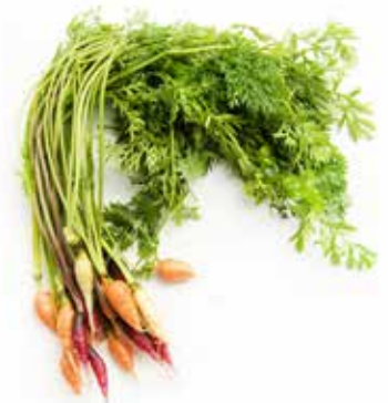
petite mixed carrots 50ct (01PMCGH-33)