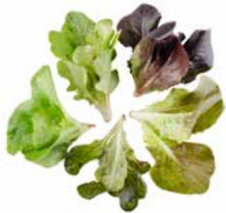
ultra mixed lettuce # (09UMX-2)