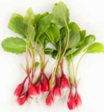
petite french breakfast radish 50ct (01FR-33)