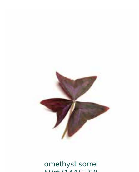
amethyst sorrel 50ct (14AS-33)