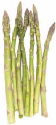
standard green asparagus 5# (04ASPS-26)

These are my spring favorites this year! Some are exciting newcomers, like the Green Opal Crystal Lettuce and Popstar Flower. Others are timeless spring classics I return to each year, such as the Squash Blossoms that started it all and the Asparagus that leaves me longing for its delight during the ten months of the year that it's out of season.