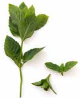
full size english mint 50ct (08EM-33) demi english mint 75ct (08EMD-33)