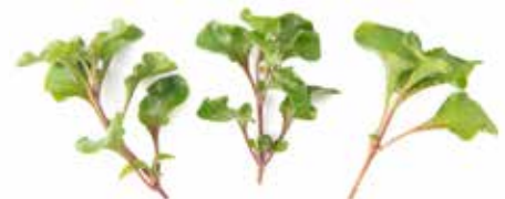
painted spinach 50ct (14PPPS-33)