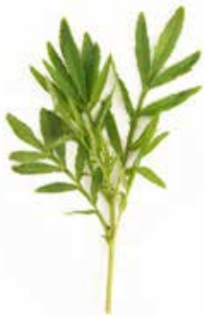
black mint 50ct (08BLM-33)