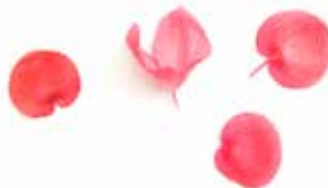
citrus begonia 50ct (05CBG-24)