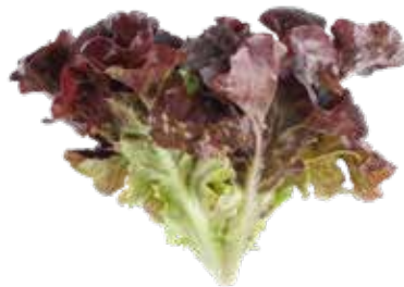
baby red oak 2# (09RO-9)