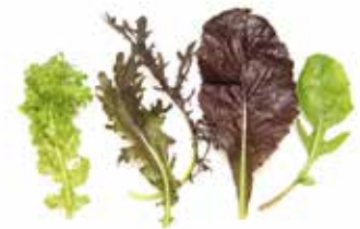
baby mixed mustard # (09MBM-2)