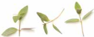
micro mountain mint (14MMT-33-E)