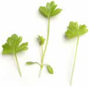
cutting celery (04MCE-33-L)