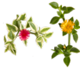
mixed crystal lettuce blossoms 25ct (09MXCLB-33)