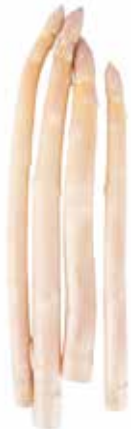
standard white asparagus 5# (04WASPS-26)