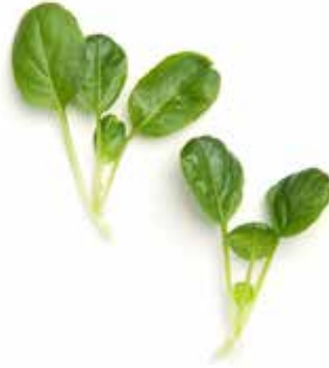
petite tat soi (09TTP-33)