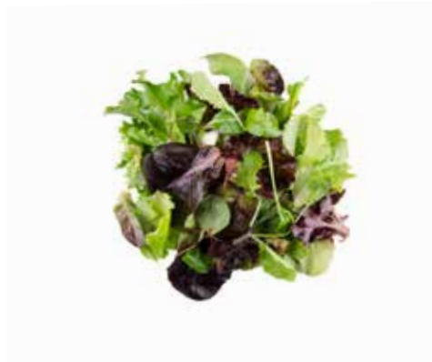
ultra mesclun (09UMESCL-33)