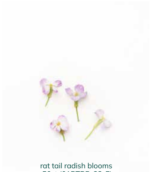
rat tail radish blossoms 50ct (01RTRB-33-E)