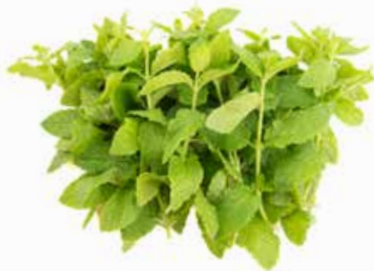
strawberry mint 50ct (08STM-33)