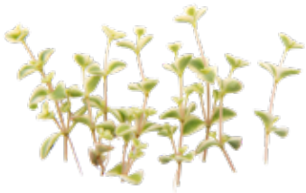
green opal crystal lettuce 50ct (09PGOCL-33)