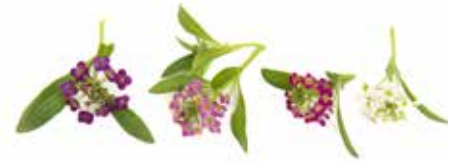
mixed sweet alyssum 50ct (05MSA-33)