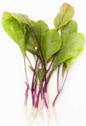
petite royal purple turnip 50ct (01PRPT-33)