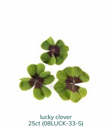
lucky clover 25ct (08LUCK-33-S)