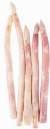
standard pink blush asparagus 5# (04MPASS-26)