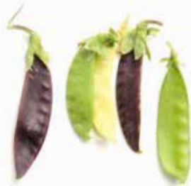
full size mixed snow peas (20MSNP-2)