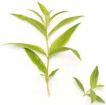
full size lemon verbena 50ct (08LV-33) demi lemon verbena 75ct (08LVB-33)