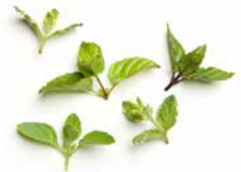
demi mint sampler 50ct (08MSB-33)