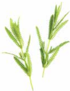
english lavender 50ct (08LA-33)