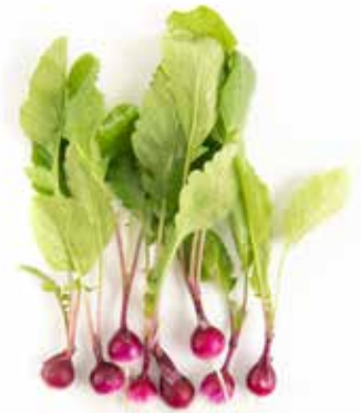
petite grape bomb radish 50ct (01PGBR-33)