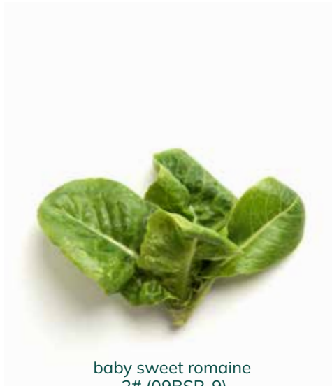
baby sweet romaine 2# (09BSR-9)