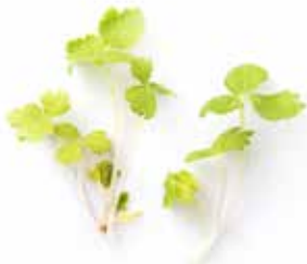
petite white celery 50ct (04PWC-33)