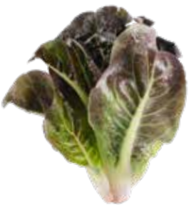
baby red rose romaine 2# (09RRR-9)