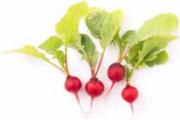
petite cherry bomb radish 50ct (01PCBR-33)