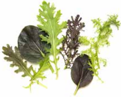
baby asian blend # (09BA-2)