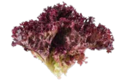
baby lolla rossa 2# (09LR-9)