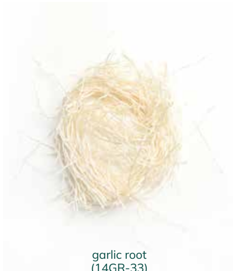
garlic root (14GR-33)