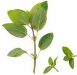
full size chocolate mint 50ct (08CM-33) demi chocolate mint 75ct (08CMB-33)