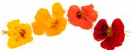
nasturtium flowers 50ct (05NSF-24)