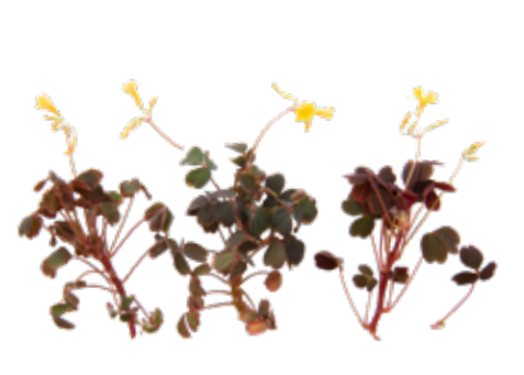
plum lucky sorrel with blooms 50ct (14PLSB-33)