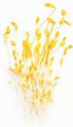
gold pea tendril (04GPT-33-L)