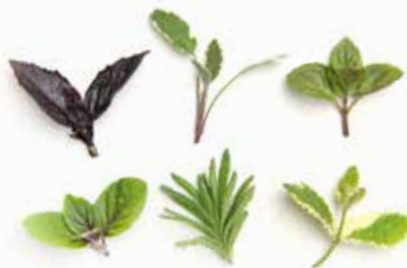
demi herb sampler 75ct (08HSB-33)