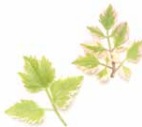
pink tipped parsley 25ct (14PTP-33)