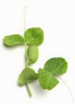
green pea tendril (04PT-33-L)