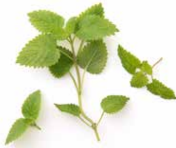
full size lemon balm (08LB-33) demi lemon balm 75ct (08LBB-33 )