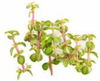
jade leaf purslane 25ct (08JPUR-33)