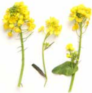
mixed mustard blossoms 50ct (09MMMB-33)