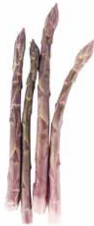
standard purple asparagus 5# (04PASPS-2)