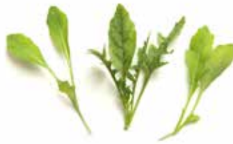
petite mixed arugula (08NGPMA-33)