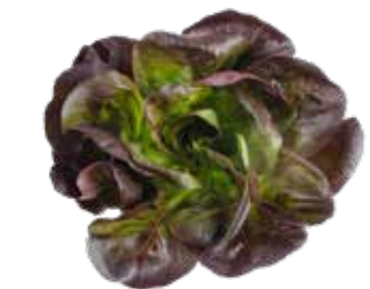
baby red lettuce rosette 2# (09BRLRO-2)