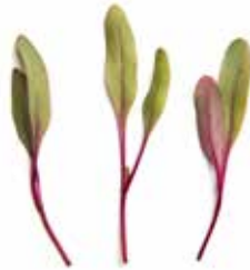
bulls blood (04BB-33-S)