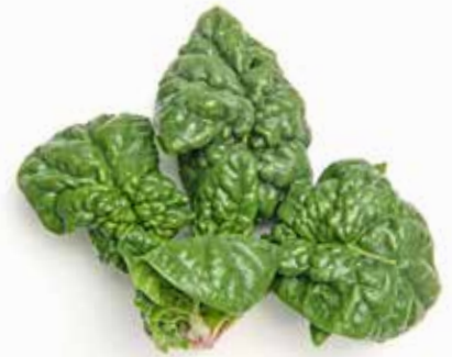
root spinach 3# (04RSPI-26)