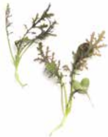
petite red ruffled mustard (09PRRMGH-33)