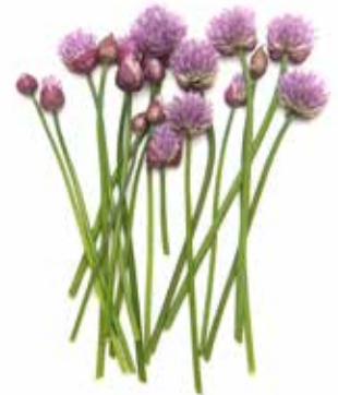
chive buds 50ct (08CBU-24) chive blooms 50ct (05CB-24)