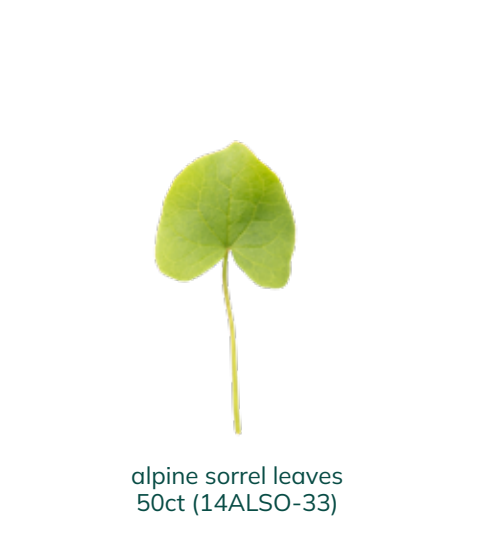
alpine sorrel leaves 50ct (14ALSO-33)