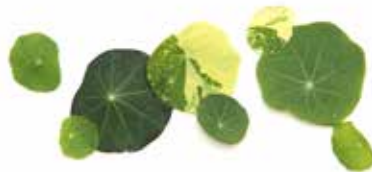
mixed nasturtium leaves 50ct (05NSLFM-33)