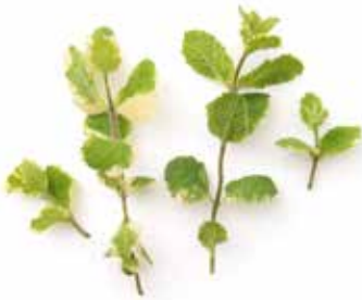
full size pineapple mint 50ct (08PIM-33) demi chocolate mint 75ct (08PMB-33)