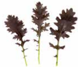
ultra purple mizuna # (09UPMI-2)