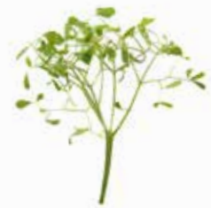
parsley pea tendril (04PPT-33)