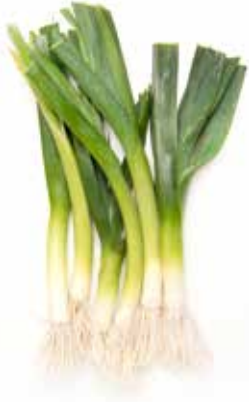
baby leeks # (01BLK-2)